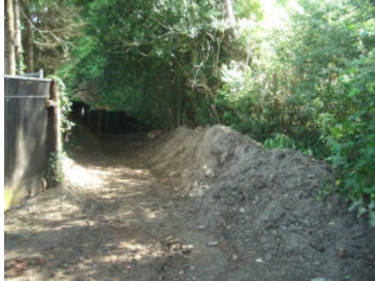
Above: new road driven into forest to reach Ash Green. Right: re-cenvlopment of Woodbury Hollow Cottages. Below right: Major re-building project at Dryad's Hall

"When they consider application do they take into account applications that have all ready been approved and where work is in progress? As an example, Woodbury Hill itself cannot take any more construction traffic until the existing developments are finished." (Answer: they are not allowed to). Rumours are the road is to be resurfaced...while all this is still going on.