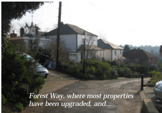
Forest Way, where most properties have been upgraded, and...

Hills Committee members—all residents of the Hills elected at the annual meeting—each month face the dichotomy of conservation versus “fit for the future”. In this and future editions will highlight some of the “best” and the “worst” changes taking place around us and to ask you to cast your vote to find the “Upgrade of the Year”.