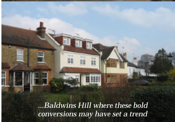
...Baldwins Hill where these bold conversions may have set a trend