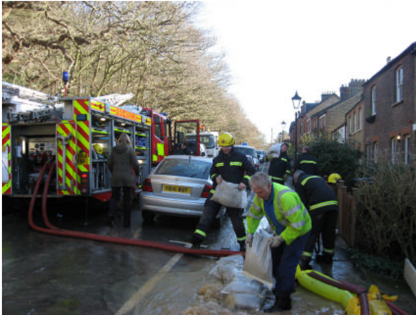
Firemen try to stop flooding of homes after Staples Road water main bursts again. Sadly Thames Water failed to stem the gusher for six hours.