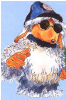
Remember The Wombles—those characters of good sense with rubbish from the 1970's? - with acknowledgements to BBC.

- Hills response to Council 6 May "Clean Up" day