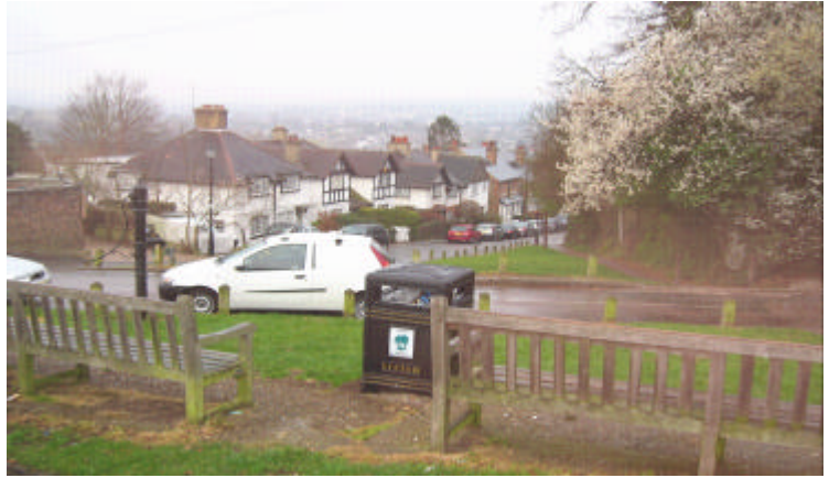
The litter bin with arguably the best view in the Hills on a damp Spring morning.

Tel: 0208 502 2370; E mail: Petetid@yahoo.com