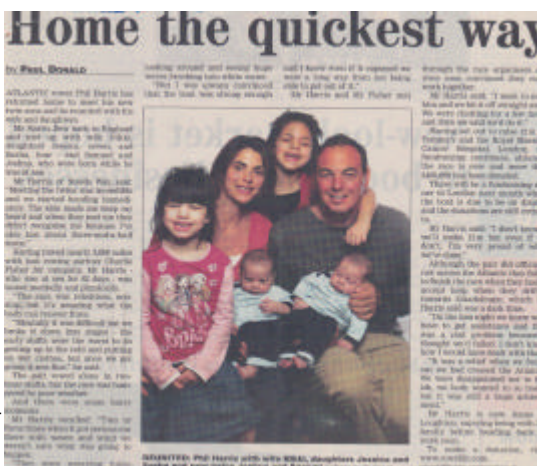
With acknowledgement to the Guardian local paper for the coverage and cuttings