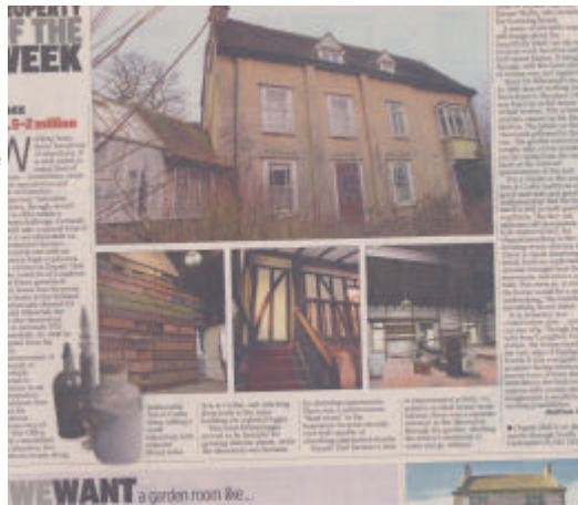
Daily Telegraph article featuring Dryads' Hall.

Sadly the Arts and Crafts house is not listed. But it is both in the Conservation Area and "pink" forest land. The Hills' Committee is watching developments closely, but standby for some "adventurous" applications. Would-be developers please note: a multi-storey flat block would not go down well!